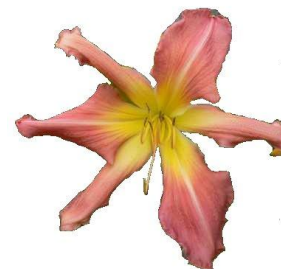
'Webster's Pink Wonder' by Webster-Cobb, 2003