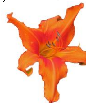
'Screamcicle' by Cochenour, 2008