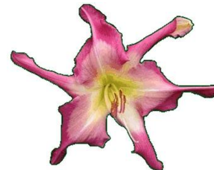
'White Eyes Pink Dragon' By Gossard, 2006